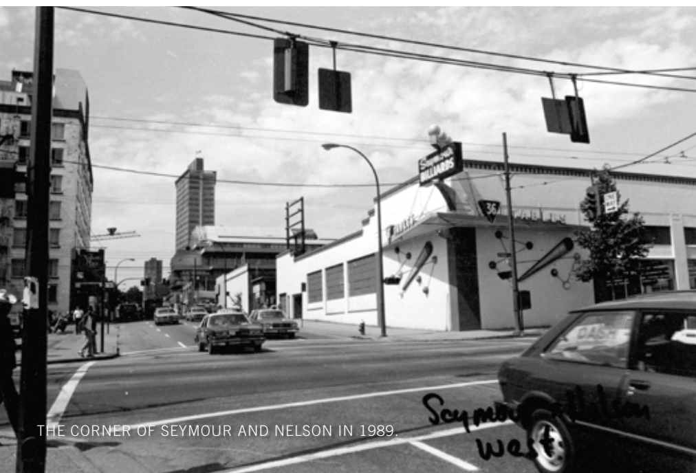
THE CORNER OF SEYMOUR AND NELSON IN 1989.

F EW CITIES HAVE CHANGED AS MUCH AS VANCOUVER HAS IN 100 YEARS—OR EVEN 30.