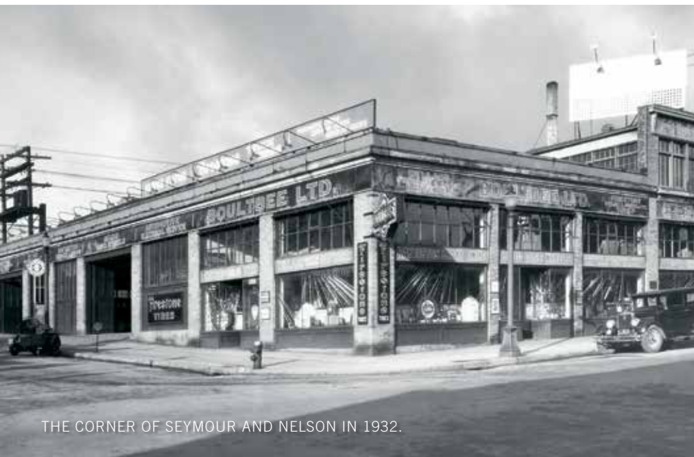
THE CORNER OF SEYMOUR AND NELSON IN 1932.